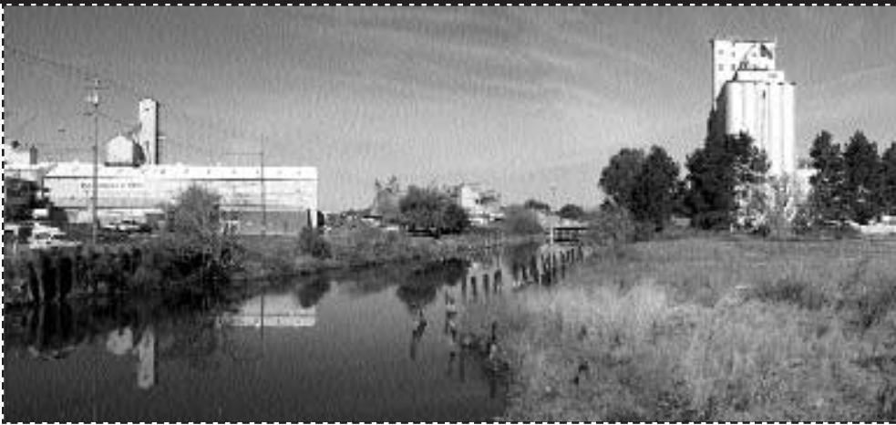
▲ Before: Redevelopment area adjacent to downtown Petaluma. [see case study below]