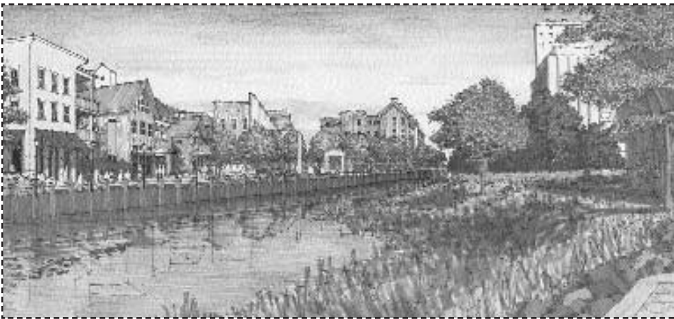
▲ After: Future development as envisioned by Petaluma's form-based zoning code.