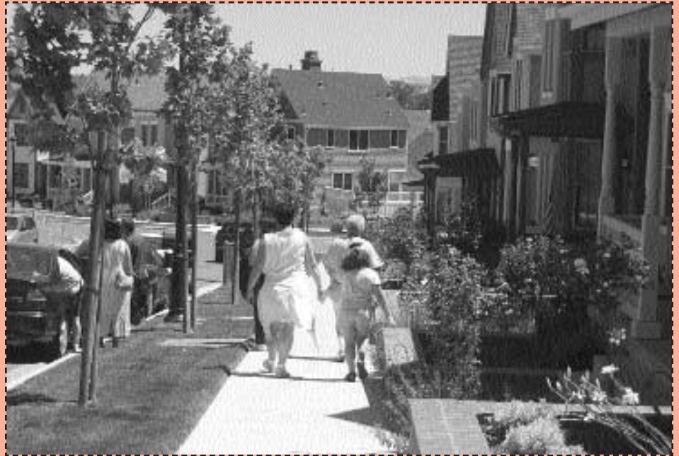
▲ Pedestrian-oriented street in Hercules' new Waterfront District.

to planning and implementation. State law requires specific plans to include a land use plan, an infrastructure development and financing plan, and development standards. While these required elements are useful, they can make specific plans costly and time consuming to prepare.