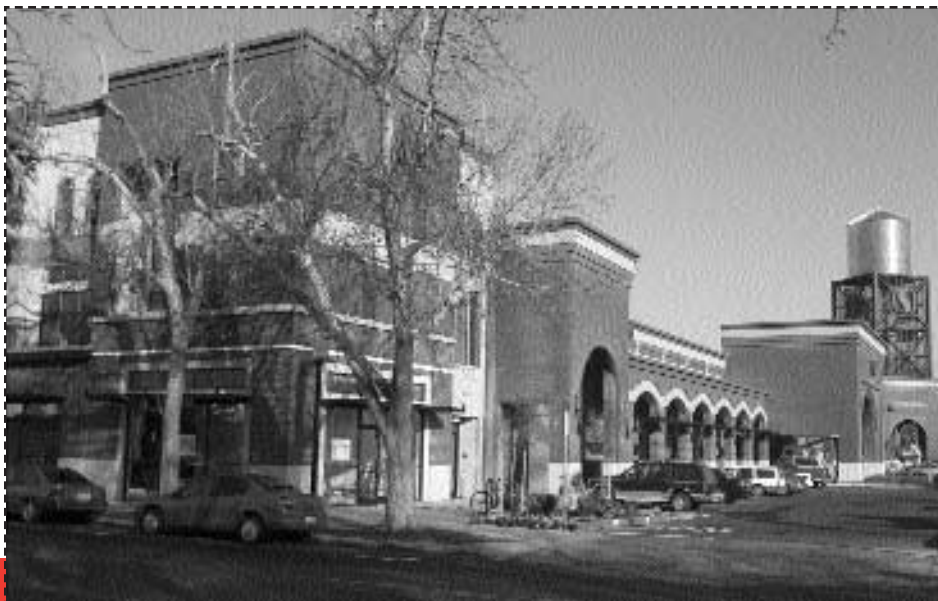
◀ Sacramento's R St. Market includes a grocery store, restaurants, retail shops and loft apartments.